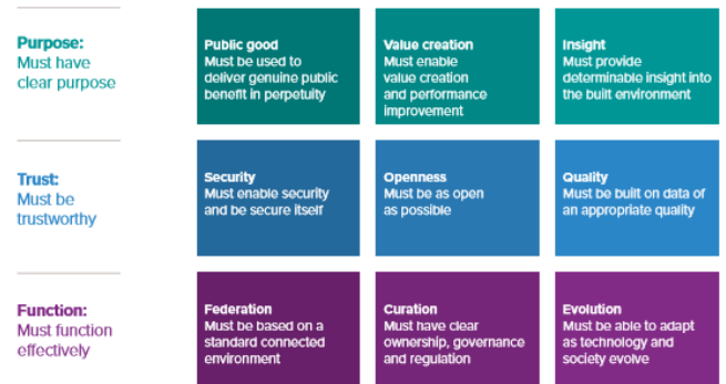
Figure 2 – Gemini principles

The centre is also establishing the “Digital Twin Hub,” a collaborative web-enabled community for those who own, or who are developing, Digital Twins within the built environment. They have published the first output of its “Digital Framework Task Group,” The Gemini Principles. The paper sets out proposed principles to guide the National Digital Twin (NDT) repository and the information management framework that will enable it. The NDT has been cited as having the potential to unlock an additional £7 billion per year of benefits across the UK infrastructure sector. The vision for the NDT is not that it will be a huge singular Digital Twin of the entire built environment. Instead, it is envisaged to consist of ‘federations’ of Digital Twins joined together via securely shared data. The main principles are illustrated in figure 2.