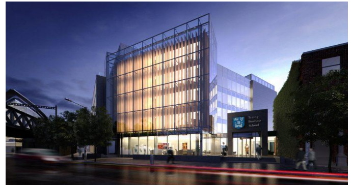
Figure 1 – CGI of TBS from Pearse Street

Members from the academic and estates staff from TCD and Invicara have explored how the Digital Twin can be expected to deliver defined outcomes, through the application of 3D models produced from BIM authoring tools which will serve as a "seed" to create a Digital Twin, in combination with information from other data sources